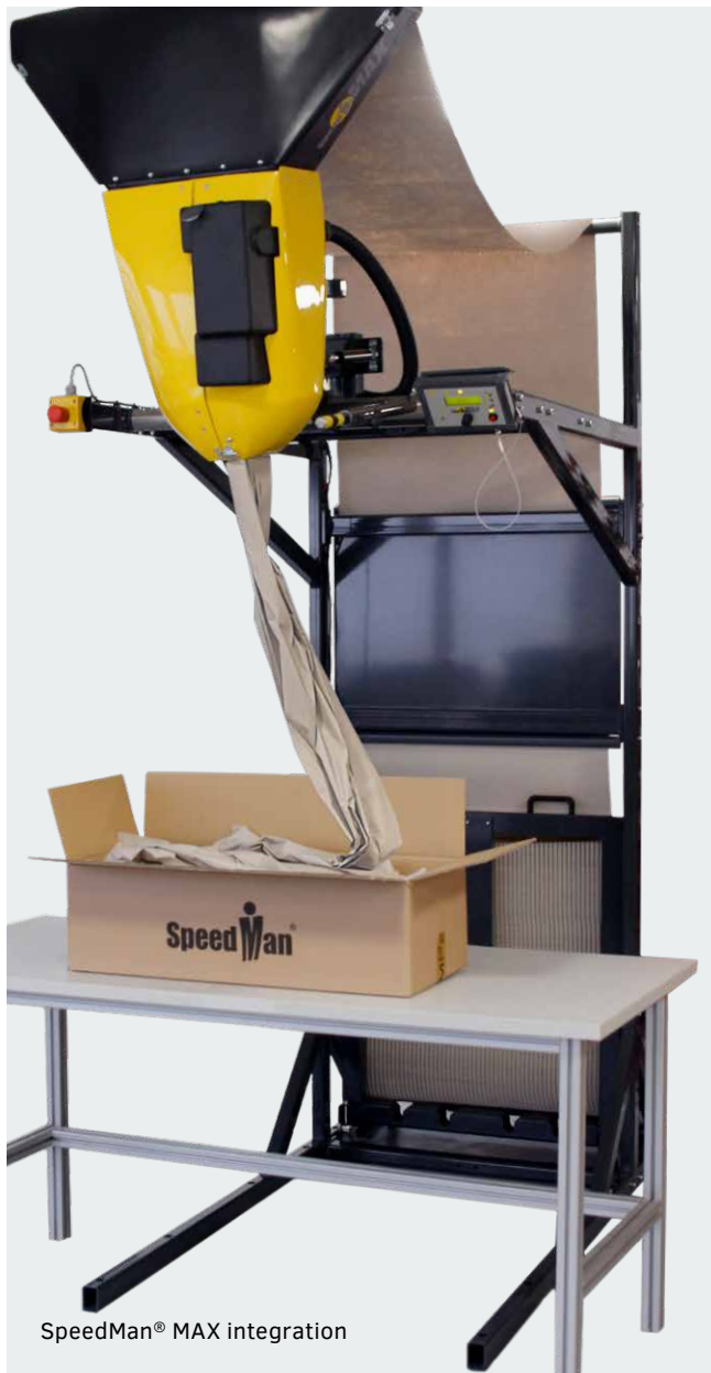
SpeedMan® MAX integration