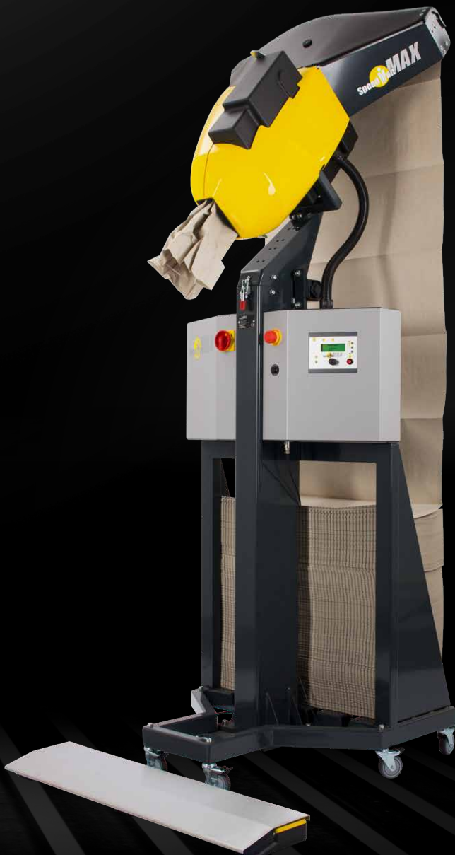
SpeedMan® MAX with frame for ComPackt® paper stack