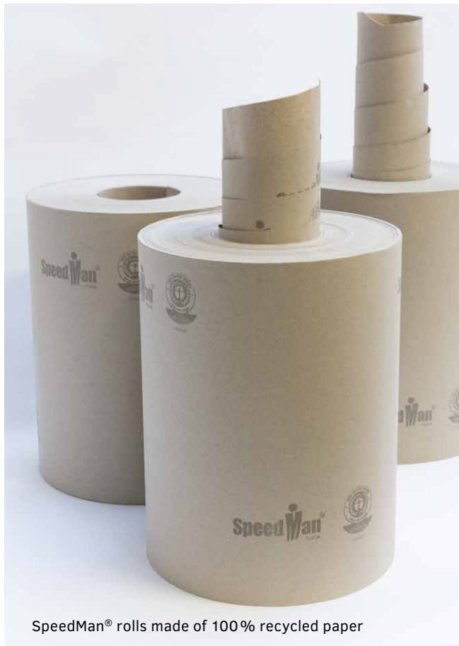
SpeedMan® rolls made of 100% recycled paper