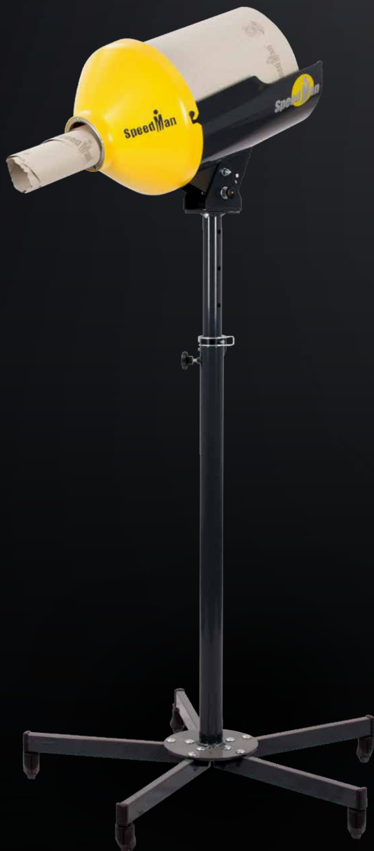
SpeedMan® Classic with roll frame