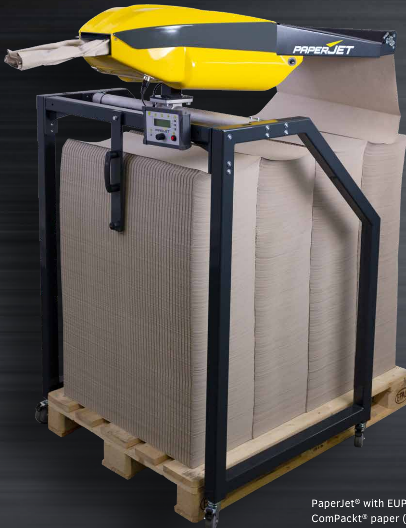
PaperJet® with EUPAL frame and ComPackt® paper (endless)