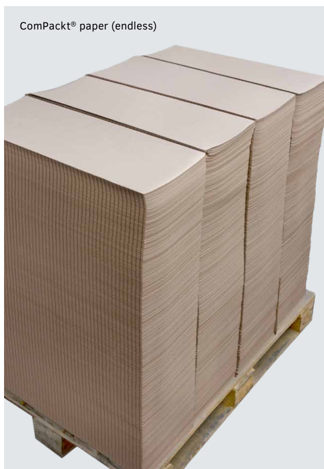
ComPackt® paper (endless)